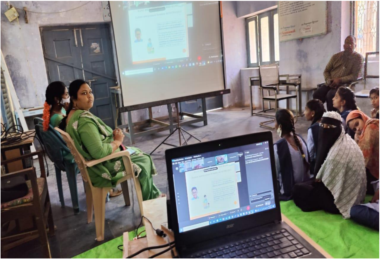
Students attended the Programme Online Programme on Intellectual Property Rights