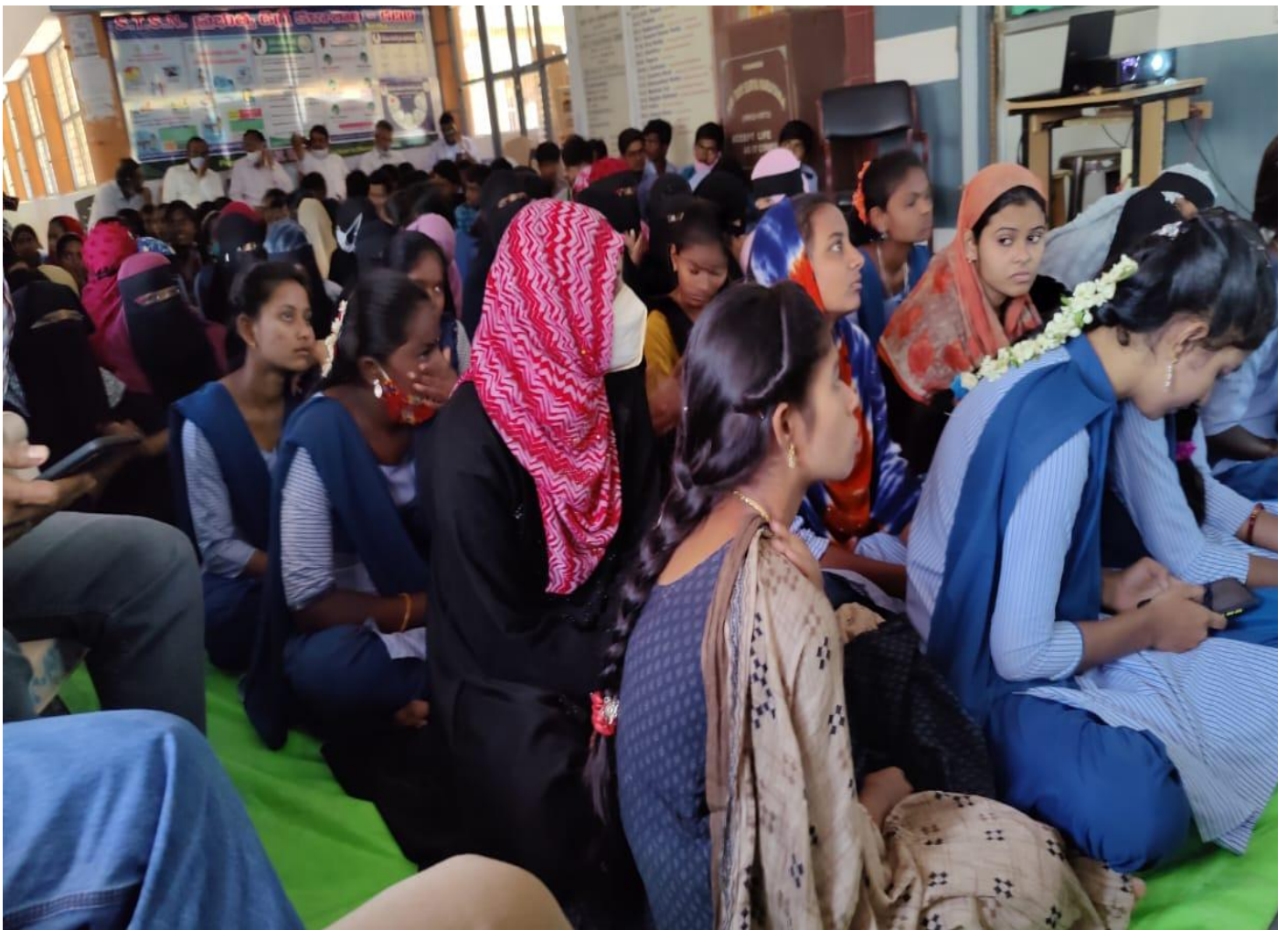
Students at Intellectual Property Rights Programme